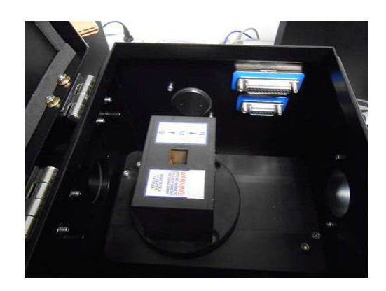
Fig. 1 : MCD accessory

MCD accessory consists of a compact 1.4T magnet (fig.1) that can be easily fitted into MOS-500 sample compartment. The magnetic shield of the standard MOS-500's photomultiplier is strong enough so high voltage is not affected by magnetic field. Contribution of natural CD is removed by a quick inversion of magnetic field polarity.